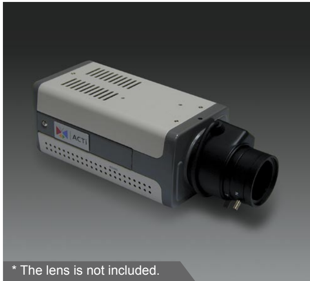
* The lens is not included.